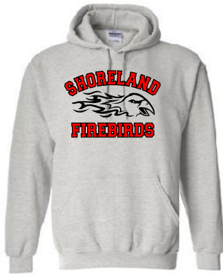
E: Hoodie UNISEX

$17.00 YS-YXL, AS-AXL 2XL $20 - 3XL $22 - 4XL $24