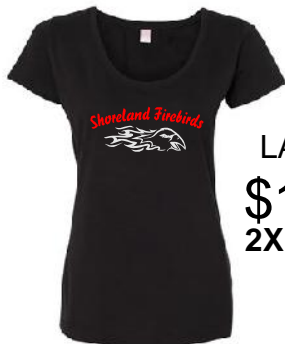
I: Scoop Neck Glitter Design Red and Silver Glitter Graphic

LADIES $18.00 AS-AXL 2XL $21 - 3XL $23 4XL $25