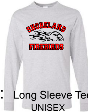
B: Long Sleeve Tee UNISEX

$8.00 YS-YXL, AS-AXL 2XL $11 - 3XL $12- 4XL $13