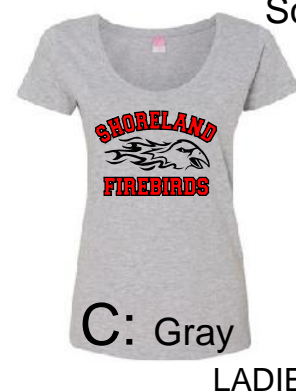
C: Gray LADIES

$11.00 YS-YXL, AS-AXL 2XL $14 - 3XL $15 - 4XL $16