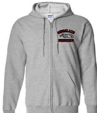
F: Zip Hoodie UNISEX

$17.00 YS-YXL, AS-AXL 2XL $20 - 3XL $22 - 4XL $24